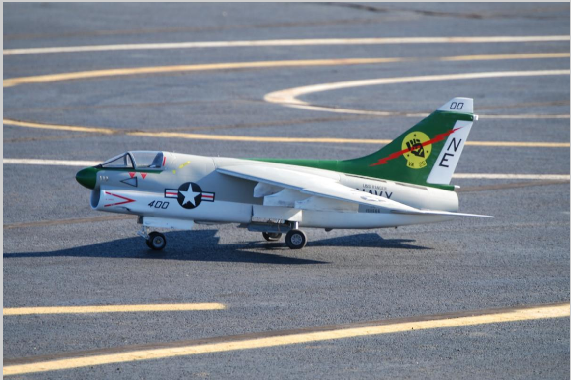
No pictures available from the meeting but here's Bob Ponte's JHH A-7 on it's take off roll at E-Jets International in Ohio.