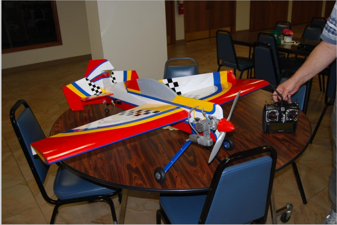
Rich Jenkin's new plane. Check out those control throws.