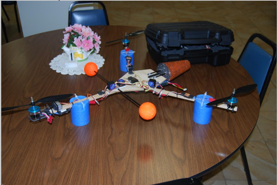
Multi rotor helicopter brought in by a member whose name escaped both the secretary and myself.